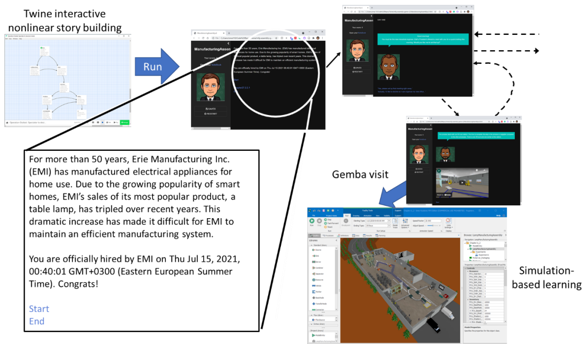
Figure 1. Interactive nonlinear storytelling and simulation-based learning game module

Interactive nonlinear storytelling and 3D simulation-based learning game module is built using Twine and Simio®. Twine is used to create the nonlinear storytelling game. In other words, it is used to create the story narrative, decisions and paths, questions, hints, and scoring system. On the other hand, Simio® is used to create the 3D simulation model that the students use as a way to visit, observe, experiment with, and study the system. The simulation visits are a replacement for visiting an actual system, i.e., Gemba visits. The simulation model is built for a table lamp manufacturing system [15]. The system involves the following process/steps: Order arrival, injection molding for the base part of the lamp, base part cooling over a conveyor built, assembly preparation, assembly of the base part and the lampshade, rework for defective assemblies, packaging, and finally shipping. The base parts of the table lamps are produced in-house, while the shades are outsourced. A portion of the game environment is shown in Figure 1.